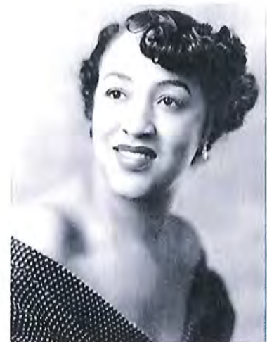
Mary Beatrice Davidson Kenner

Creator of feminine and bathroom products