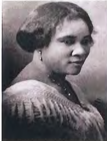
Madame C. J. Walker

Creator of the straightening Comb and Hair Care products