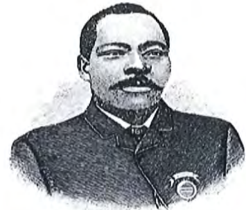
GRANVILLE T. WOODS.

Creator of the straightening Comb and Hair Care products