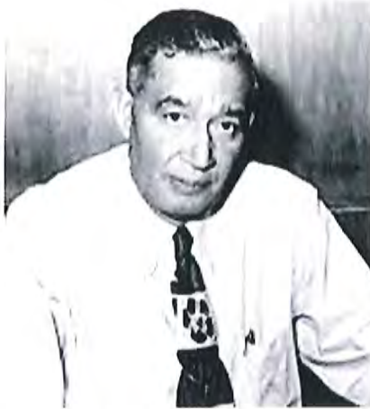
Frederick M. Jones: